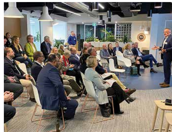
Invited Guests for RBS Relief Fund Launch.

Small financial grants for farming families which address the immediate day-to-day needs following an event or natural disaster. The Support Grants are designed