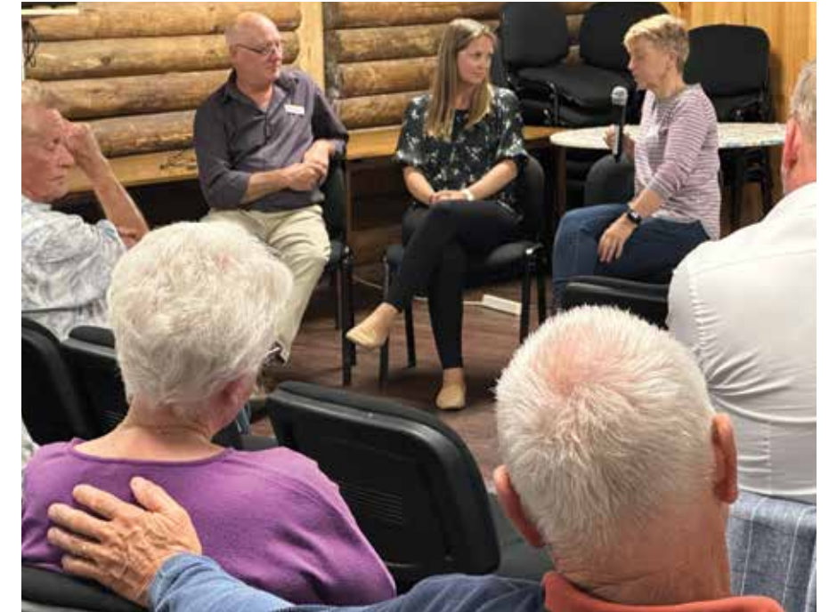
SA Farmers Recovery & Reconnect Tour to Kangaroo Island

We thank the Wyatt Trust for their ongoing commitment to build capacity with regional