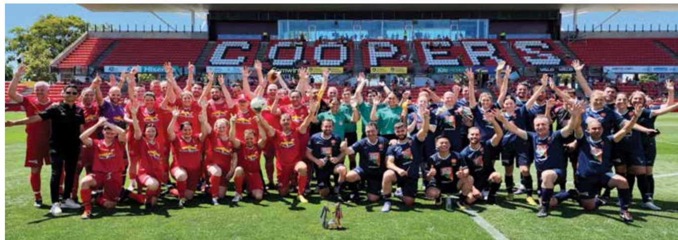
SA Flood Recovery Charity Match, SA Government (Red) and Pick A Local! Pick SA! (Blue)

The Relief Fund is a natural extension of our work as rural financial counsellors with family farms, a role we have proudly fulfilled since 2006. Through this fund, we're enhancing our ability to provide additional services, crucial in the ongoing recovery process faced by rural, regional, and remote agricultural communities.